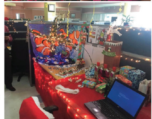
Best Dressed Cubicle by Nyla