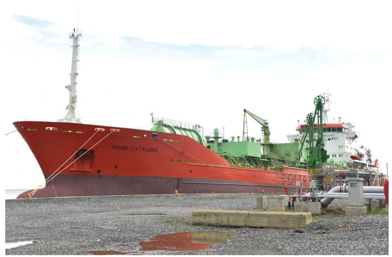
The inaugural loadout of methanol from the Port of Brighton, La Brea.

An official release from CGCL notes that traditionally, methanol has only been shipped from the Port of Point Lisas, Point Lisas Industrial Estate, where petrochemical plants are located. However, having the development of port and marine facilities at the Port of Brighton opens up new opportunities for energy shipping in this country.