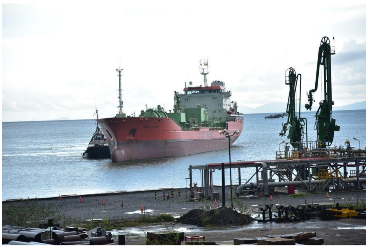
The MT Trans Catalonia sails away from the Port of Brighton, La Brea, on Monday 28th September 2020, with the inaugural loadout of methanol from Caribbean Gas Chemical Limited.

CGCL reports that the inaugural loadout of methanol was loaded to the vessel, MT Trans Catalonia.