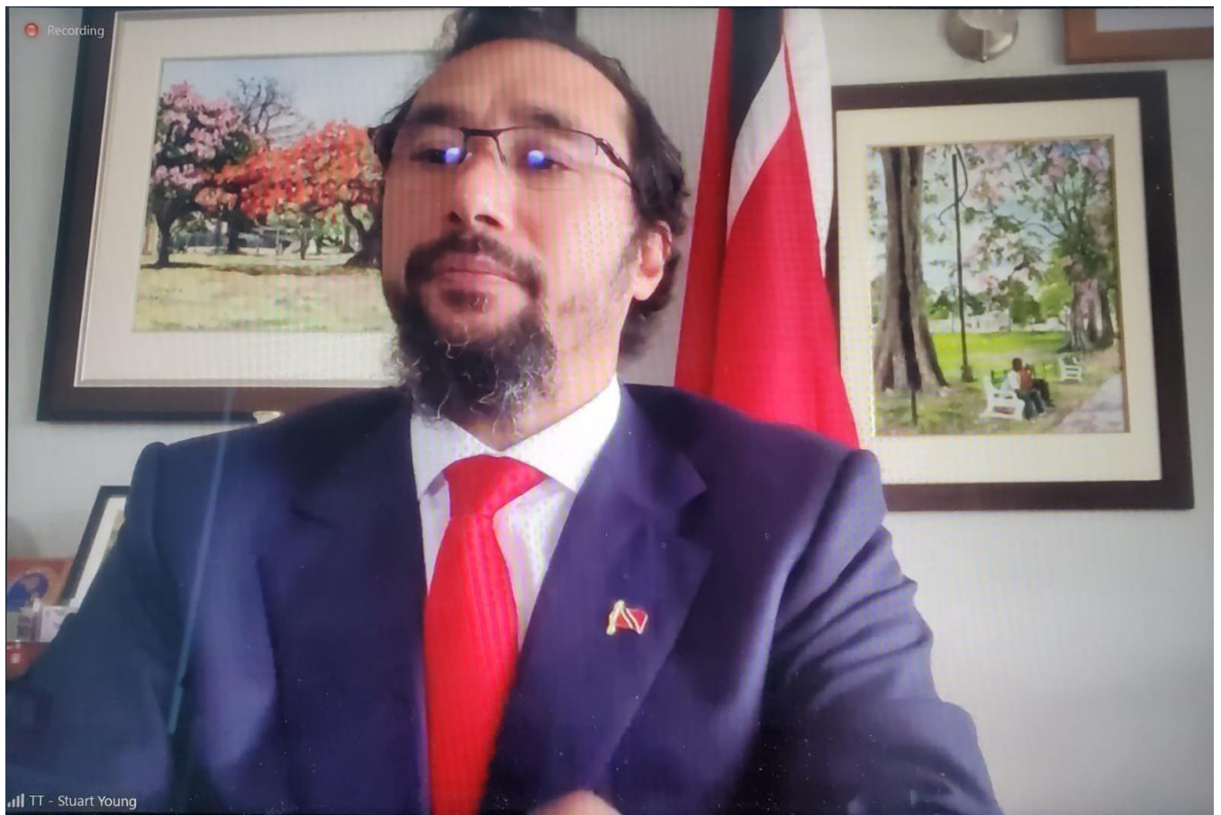
Minister of Energy and Energy Industries and Minister in the Office of the Prime Minister Honourable Stuart Young M.P., chairing the 55th Council of Experts Meeting virtually.