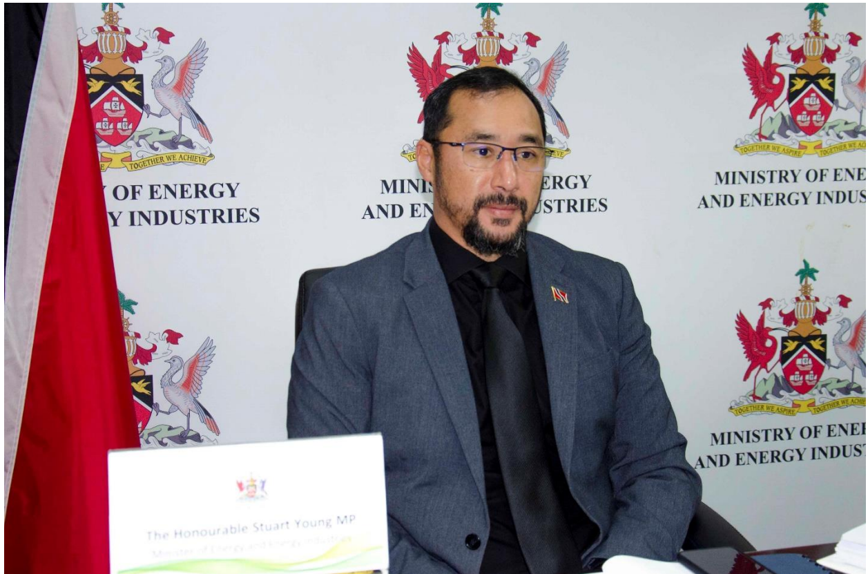
The Honourable Minister of Energy and Energy Industries and Minister in the Office of the Prime Minister Stuart Young MP contributes to the 23 rd GECF Ministerial Meeting.