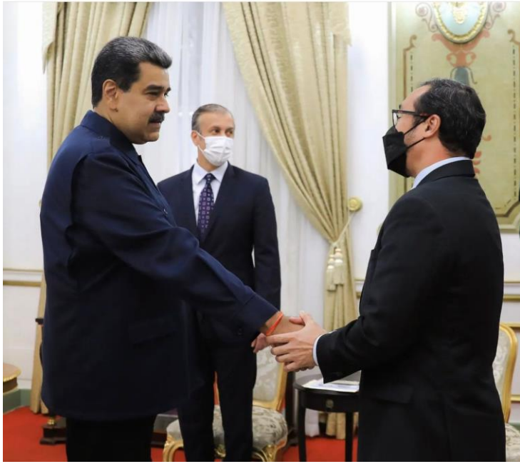
President Nicolás Maduro greets the Minister of Energy and Energy Industries, The Honourable Stuart R Young, M.P