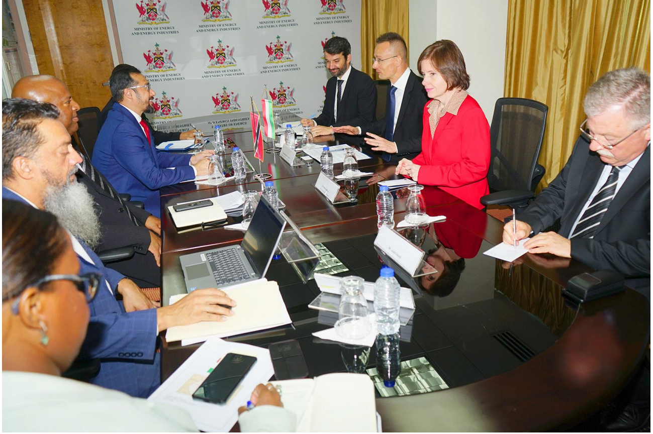
The Honourable Stuart R. Young, MP, Minister of Energy and Energy Industries and Minister in the Office of the Prime Minister and His Excellency Mr. Péter Szijjártó, Minister of Foreign Affairs and Trade of Hungary discuss Trinidad and Tobago's natural gas exports and the capacity of the Atlantic LNG Trains.