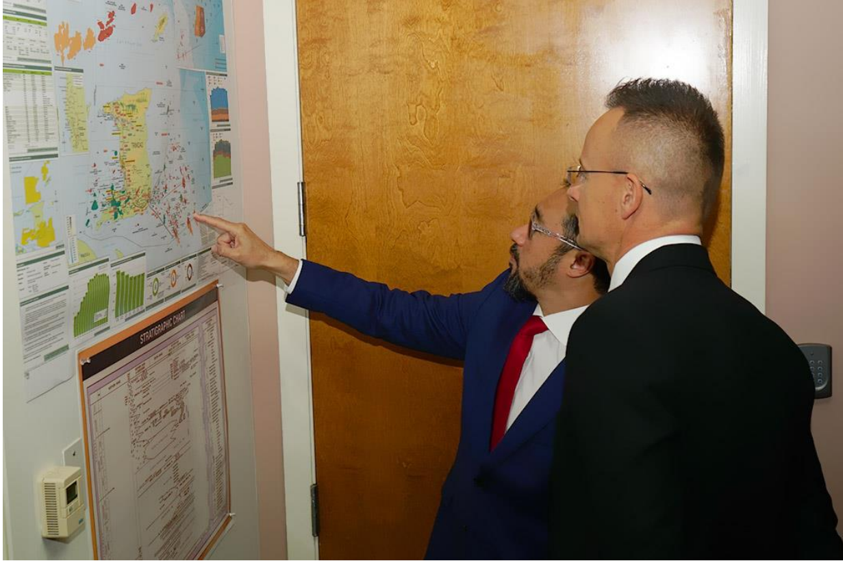
The Honourable Stuart R. Young, MP, Minister of Energy and Energy Industries and Minister in the Office of the Prime Minister points out Trinidad and Tobago's strategic position for natural gas exports to His Excellency Mr. Péter Szijjártó, Minister of Foreign Affairs and Trade of Hungary.