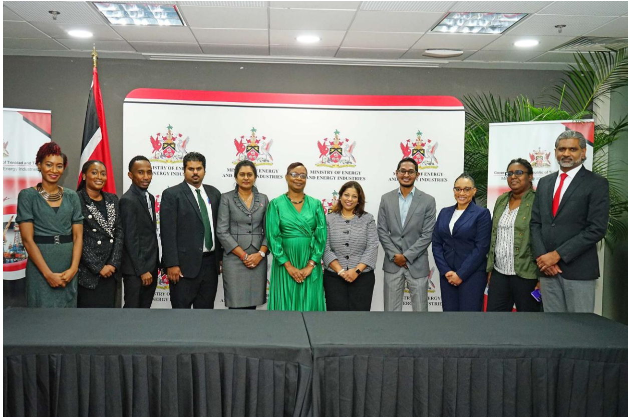
Members of the negotiating teams attached to the Ministry of Energy and Energy Industries and EOG Resources.