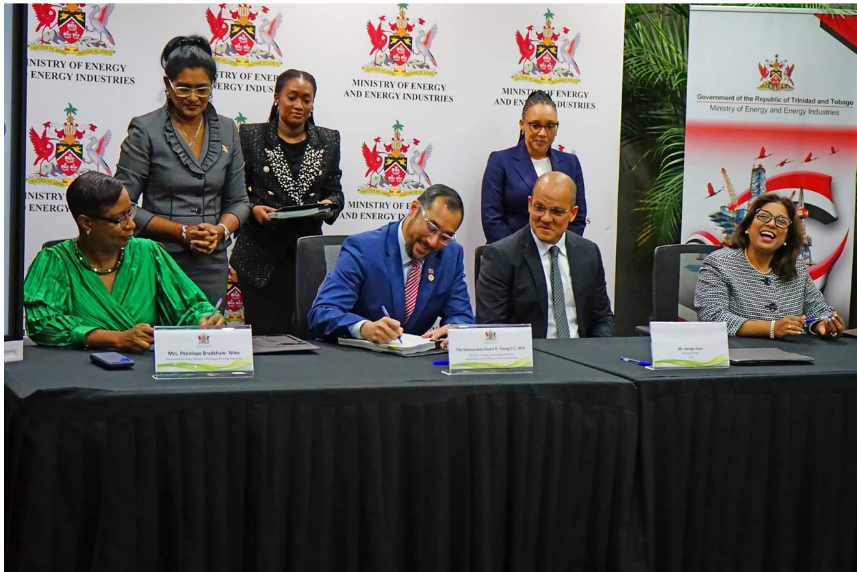
The Honourable Stuart R. Young S.C., M.P. Minister of Energy and Energy Industries and Minister in the Office of the Prime Minister signs the award of production sharing contracts to EOG Resources.