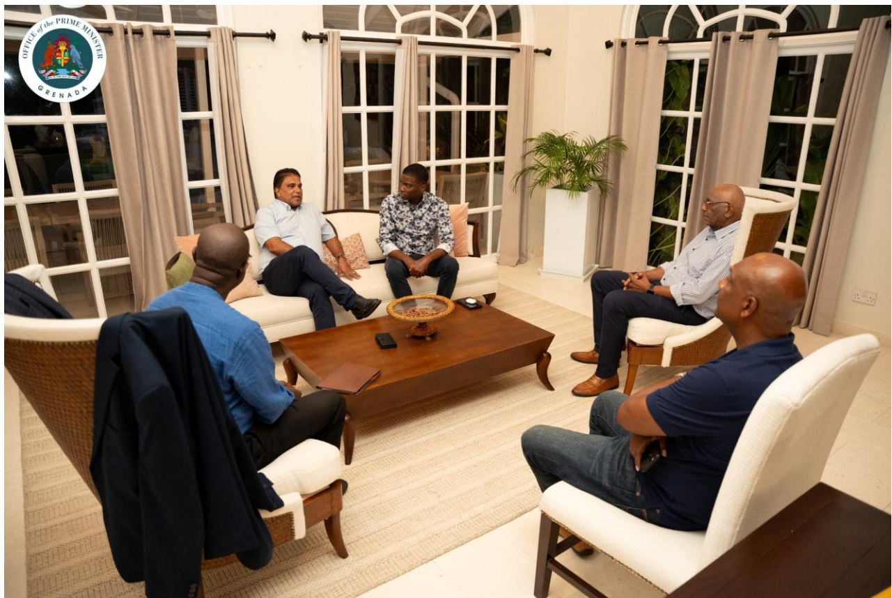
Dr the Honourable Roodal Moonilal Minister of Energy and Energy Industries and the Honourable Dickon Mitchell, Prime Minister of Grenada along with representatives of Grenada's Hydrocarbon- Technical Working Group in discussions.