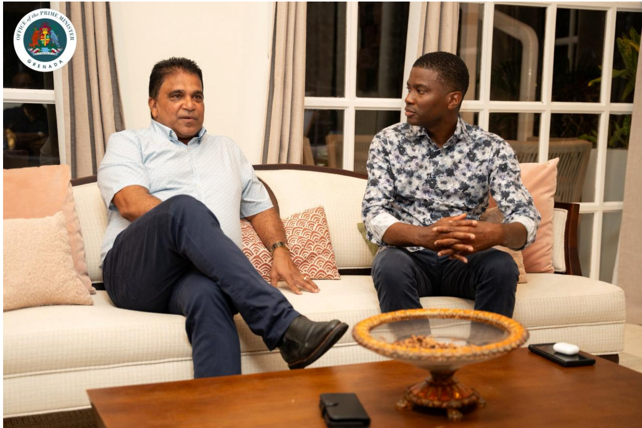
From left to right: Dr the Honourable Roodal Moonilal Minister of Energy and Energy Industries and the Honourable Dickon Mitchell, Prime Minister of Grenada.